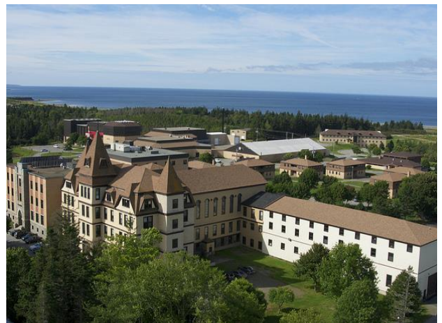
Saint-Anne University (Church Point, Nova Scotia, Canada)