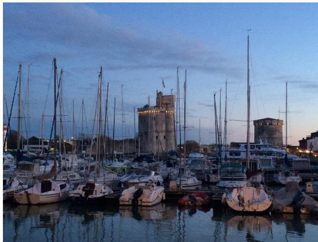
La Rochelle, France