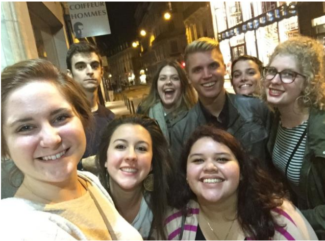
Escadrille Louisiane program participants in September 2016 (Rennes, France)