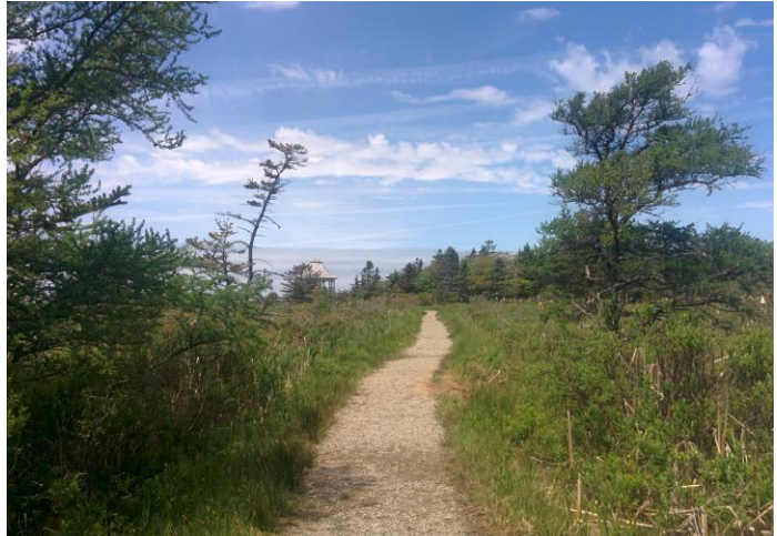
A path on Saint-Anne University's campus