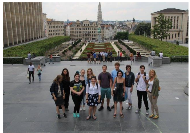
Scholarship recipients in Liège, Belgium in July 2016