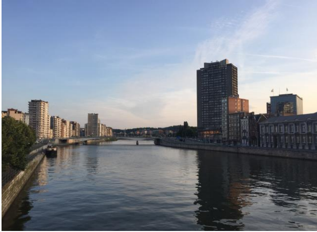
City of Liège in Belgium