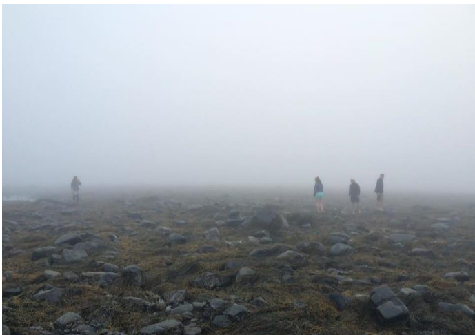
Along St. Mary's Bay (Saint-Anne University)