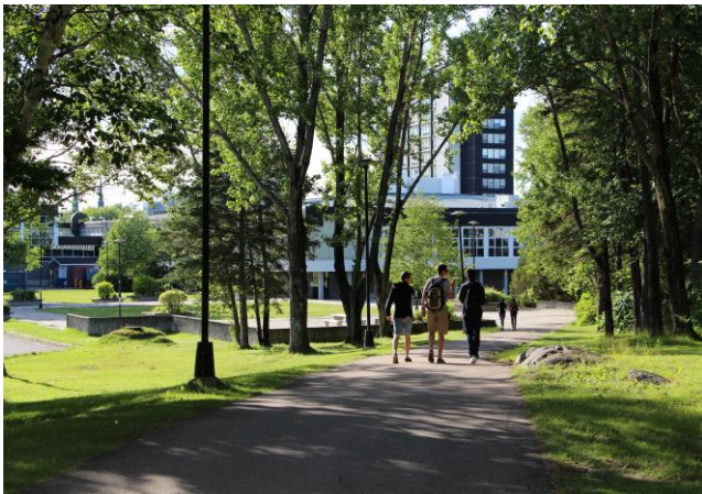
Jonquière College's Linguistic Center (Quebec, Canada)