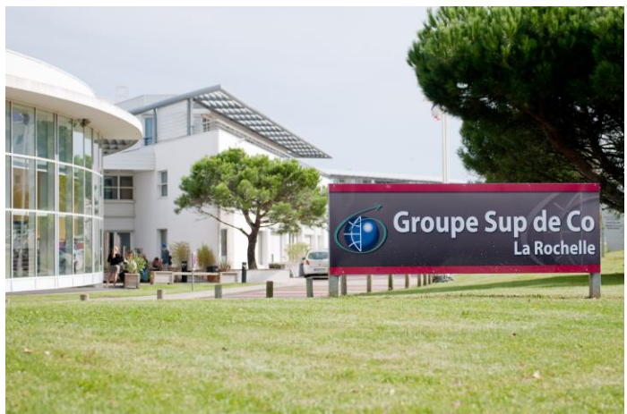
Business School (La Rochelle, France)