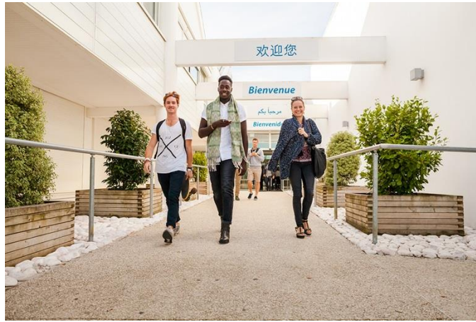
Business School (La Rochelle, France)