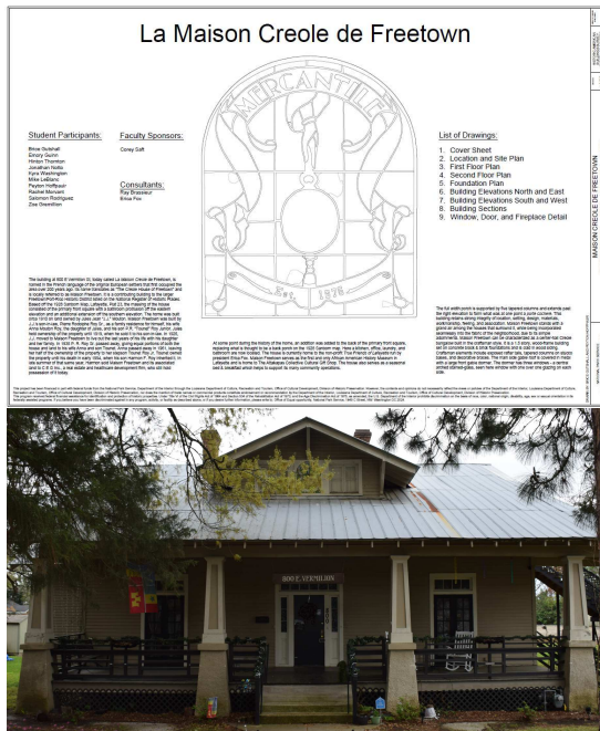
FY 2023-2024 HPF Grant, ULL School of Architecture & Design Historic American Buildings Survey & StoryMap La Maison Creole de Freetown https://arccg.is/0BRB5K

To learn more about the Division of Historic Preservation, view this VIDEO about the programs we offer.