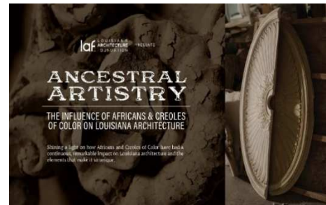
LEH Documentary Film of the Year

To learn more about the Division of Historic Preservation, view this VIDEO about the programs we offer.