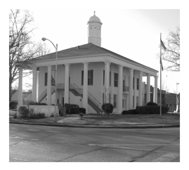
Town of Homer Historic District FY 2015-16 HPF/CLG Grant Recipient for Historic Standing Structures Survey

Claiborne Parish Courthouse, Homer, Louisiana