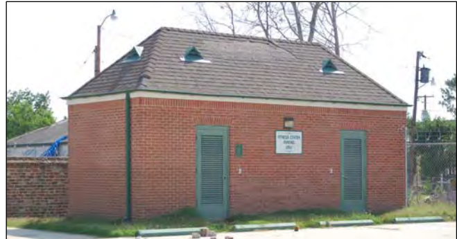
Building 35a (Not Contributing to NRHD)